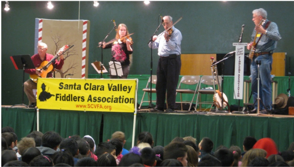
Cadwallader Elementary School Payout, March 22, 2012

A reminder: if you'll be at the May jam and haven't picked up your copy of the 2012 Member Directory, stop by the membership desk to get it.